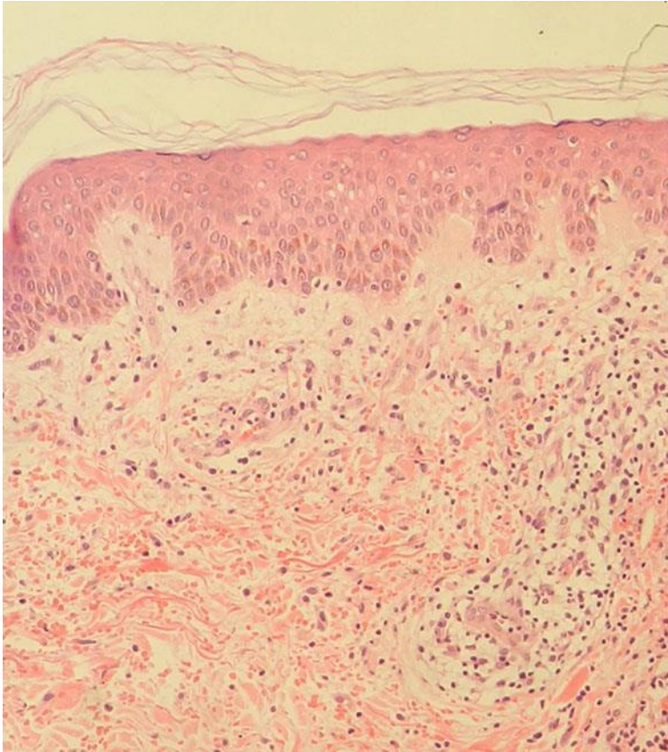
Fig. 5. Perivascular lymphocytic infiltrate, intense extravasation of red blood cells and endothelial hyperplasia, compatible with drug eruption. HE. Original magnification. \times 100 .