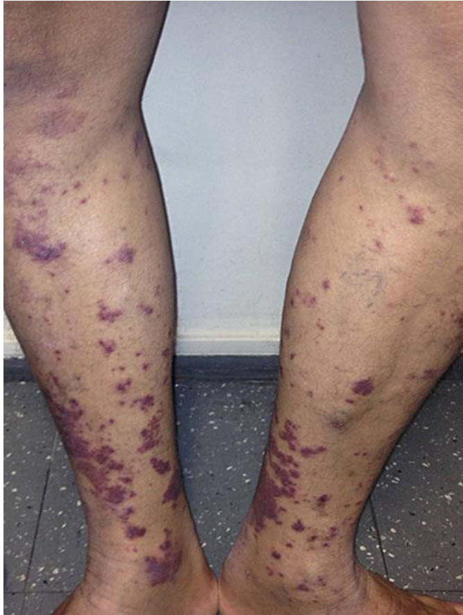
Fig. 4. Skin lesions on the legs.