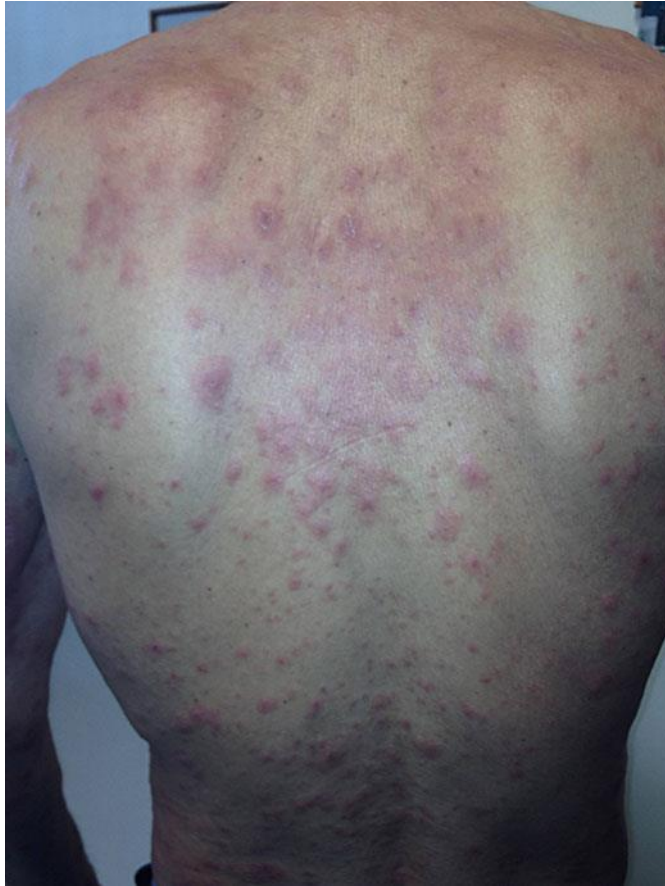
Fig. 1. Skin lesions on the back.