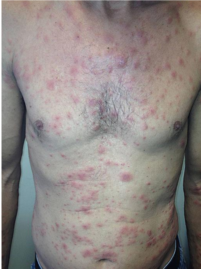
Fig. 2. Skin lesions on the chest.