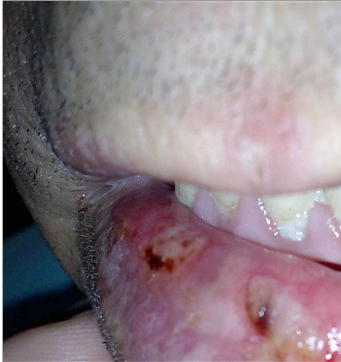
Fig. 3. Ulcers on the lower lip.