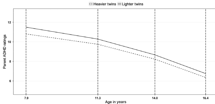
Figure 1 Predicted ADHD symptoms of MZ twins for CPRS-R from age 8 to 16 years