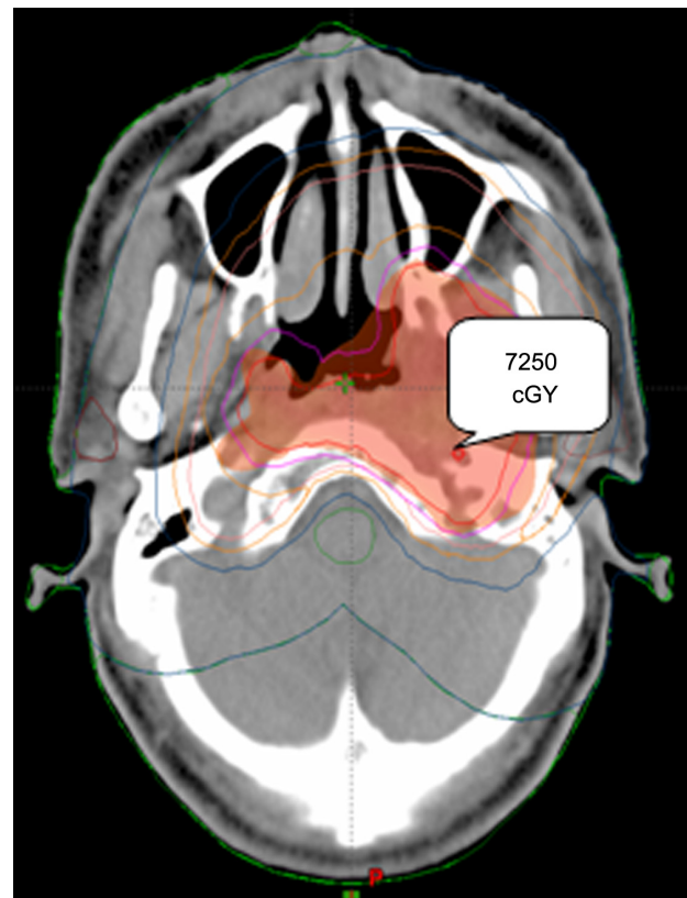
Figure 2 A dosimetric map around the encased carotid artery. Note: A point dose of 7250 cGy (104% of the prescribed dose) is indicated within the artery.

sunitinib. In one of the two patients, significant tumor shrinkage (>60%) was noted on the MRI study carried out before the fatal hemorrhagic event. The tumor necrosis resulted in the naked internal CA exposing to the nasopharyngeal cavity. In our case, the series of MRI studies disclosed encasement of the artery before (Figure 1A–D), and rapidly spreading necrosis after, the treatment (Figure 1G and H). Therefore, we suggest that pre-existing invasion of the arterial wall before, and direct exposure of the injured artery to the nasopharyngeal cavity after, the treatment might have contributed to the subsequent CBS with fatal epistaxis. Furthermore, another mechanism called “radiation recall” has been reported after targeted therapies (cetuximab, bevacizumab, mammalian target of rapamycin inhibitors). 14–16 Some targeted agents possibly increase the risk of radiation-related vascular inflammation and injury. Therefore, we propose the avoidance of the addition of cetuximab to chemoradiotherapy in patients with tumor possibly invading the CA.