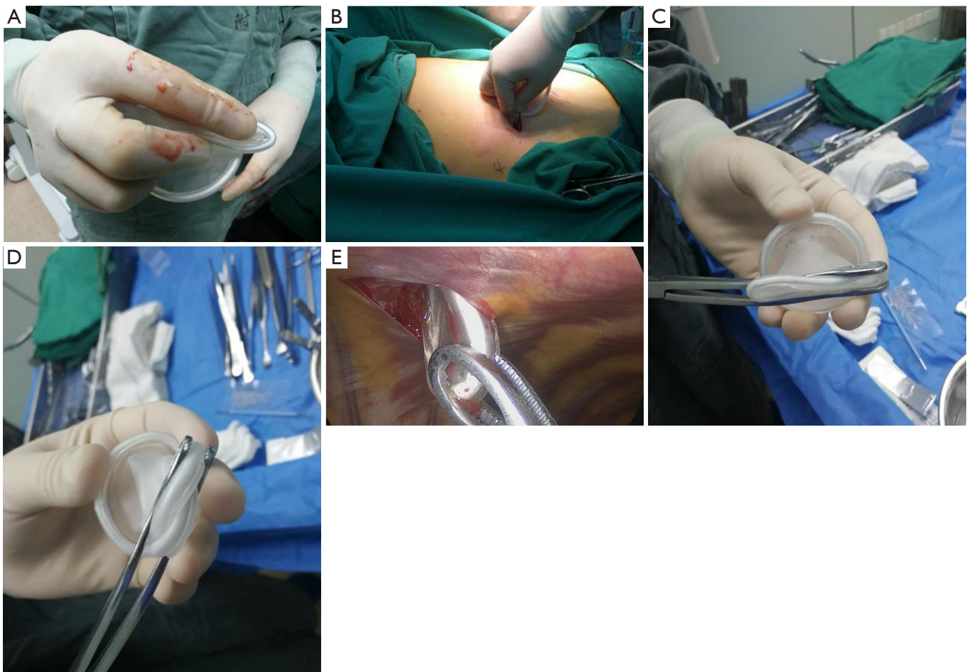
Figure 2 The methods of placing the incision protective sleeves. (A) Squeezed one end of the sleeve flat; (B) placed the sleeve, guiding with the index finger; (C) guiding the sleeve with sponge forceps after the opposite side of the sleeve is squeezed flat by the sponge forceps; (D) guiding the sleeve with sponge forceps after the sleeve is squeezed flat in the shape of a figure 8; (E) internal traction with sponge forceps.