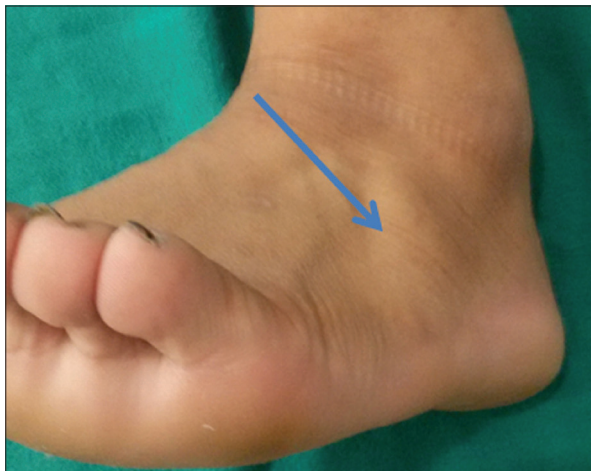
Figure 1: Normal extensor digitorum brevis in a healthy individual

On average, the participating patients were 56-year-old (standard deviation [SD] 14.0; age range: 20–88 years). Mean age for lumbar canal stenosis was 56.30 (13.95) (mean: Years [SD]). Male to female ratio was 1.5:1. Mean age for intervertebral disc prolapse (IVDP) in our study group was 27 years (age range from 19 to 46 years). In this study, group ratio of canal stenosis and disc prolapsed was 60:40 among males and 40:60 among females, respectively.