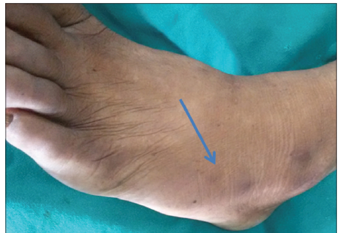
Figure 2: Extensor digitorum brevis wasting in a case of lumbar canal stenosis