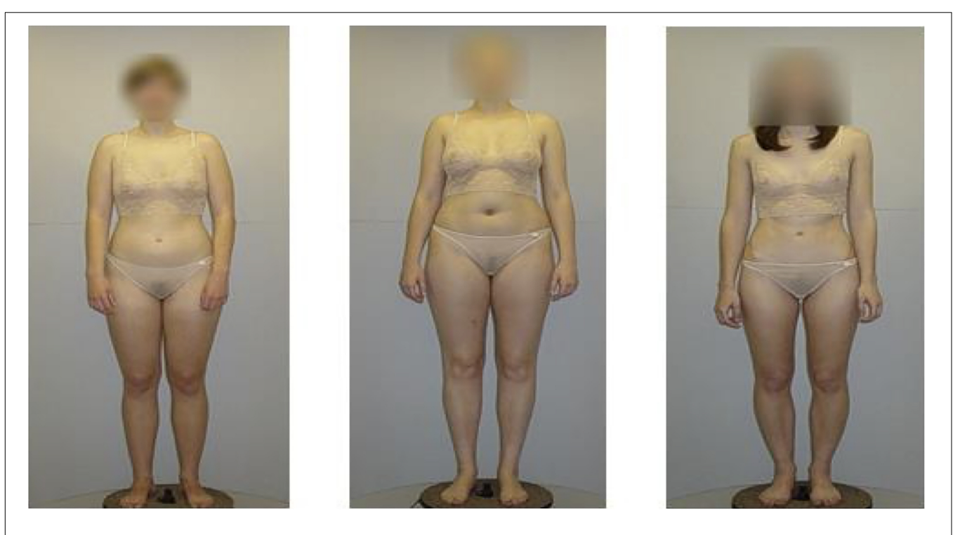
FIGURE 1 | An example of the 2D forward facing images used in this study [the stimuli were collected in the Smith et al. (2007a) study].

participants were given a debrief which outlined the aims and predictions of the study.