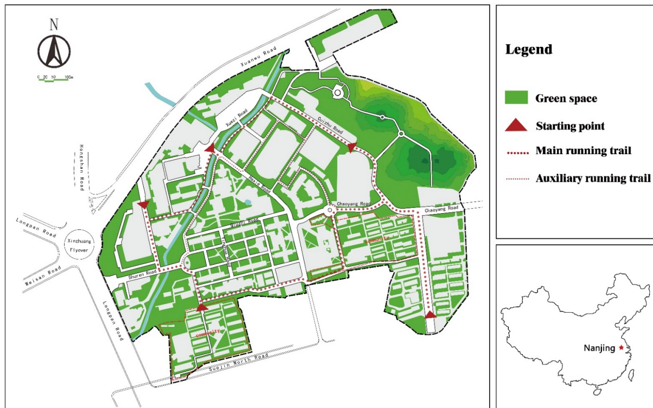
Figure 1. Study area with the trail network.

The wonderful site condition (Figure 1) and representative samples provide good conditions for our upcoming natural experiments.