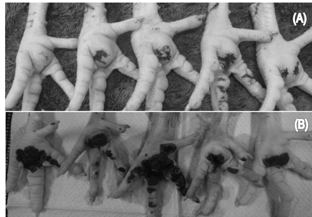
Fig. 1. Typical footpad lesions in broilers reared on dry litter (A) and wet litter (B) for 7 weeks (49-day-old). The mean FPD scores, 0.70 on dry litter (A) and 2.58 on wet litter (B), differed significantly ( P < 0.01 ).

Changes in the mean FPD score among birds that were moved from the wet-litter house to the dry-litter house are shown in Fig. 3 (B). The mean FPD score of 15 birds selected at 21 days of age was 1.53 at the time of relocation. After relocation, the score started to decrease and was 0.88 at 49 days of age. Similar changes were observed among