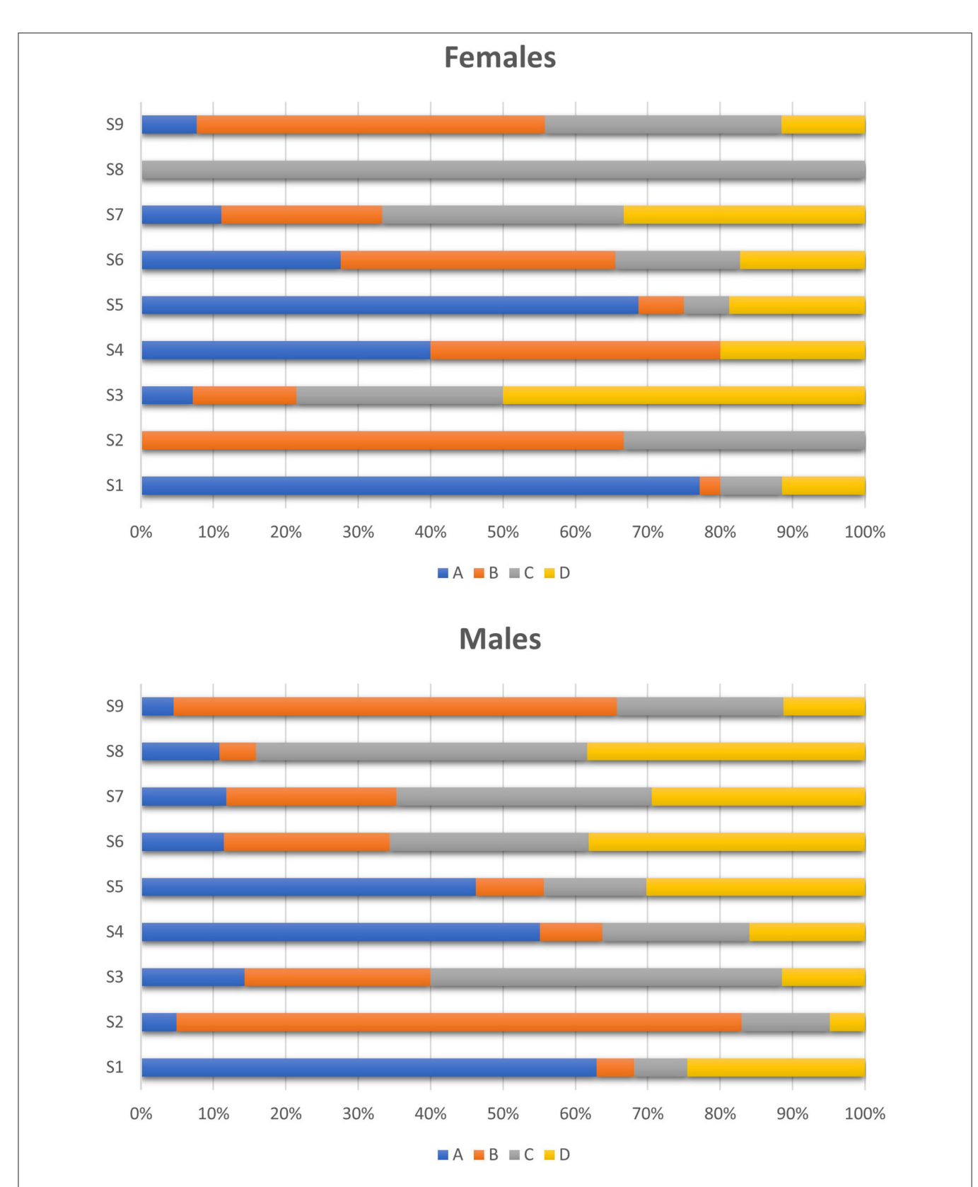
FIGURE 2 | Class use by women and men regarding the sports discipline. Group A: anaerobic sports (strength, power, and speed); Group B: aerobic sports (endurance); Group C: mixed aerobic/anaerobic sports; Group D: combat sports and others. S0, P1 and M2 were not represented, due to the too small number of AAFs, i.e., 0 for S0, 5 for P1 (3 men, 2 women) and 1 for M2 (1 woman).