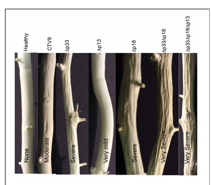
FIGURE 3 | Stems of Citrus macrophylla infected with mutants of CTV with all combinations of deletions of the p33, p18, and p13 genes showing different degrees of stem pitting.

One unexpected result was that in severely pitted areas, GFP fluorescence as a marker of virus replication was observed in regions normally made up of mature xylem or wood (Tatineni and Dawson, 2012). CTV was found in a group of cells that appeared to be on the woody side of the vascular system. In