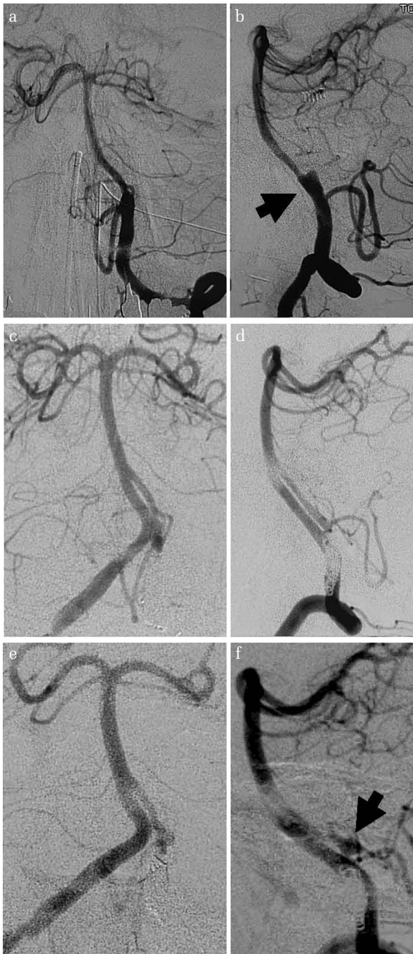
Fig. 1 Case 1: Conventional angiography of the left VA performed at the time of admission showed aneurysmal dilation on the left VA involving the PICA origin (a: frontal view, b: lateral view, arrow : dilation). Conventional angiography of the right VA after proximal occlusion of the left VA and endovascular coiling showed persistent retrograde flow to the residual aneurysm and left PICA (c: frontal view, d: lateral view). Follow-up angiography of the right VA performed 6 months later revealed enlargement of the residual aneurysm ( arrow ). Filling was via the contralateral right VA (e: frontal view, f: lateral view). VA: vertebral artery, PICA: posterior inferior cerebellar artery.