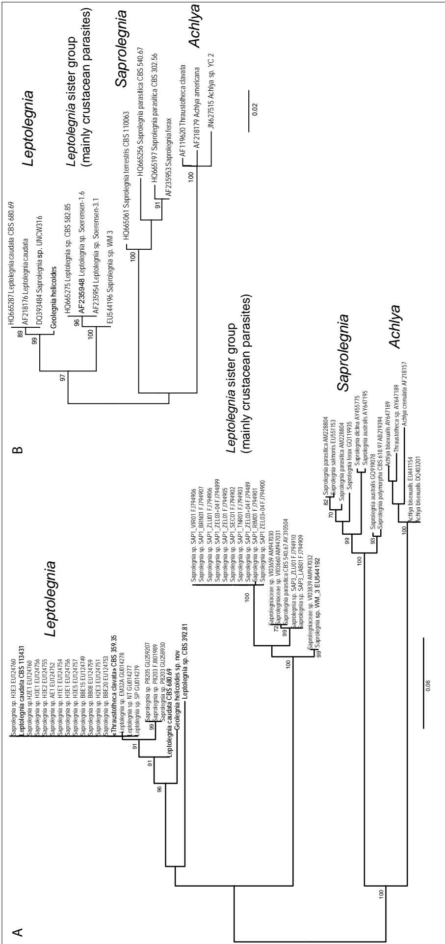
Fig. 3. Maximum likelihood phylogenetic trees showing the position of Geolegnia hellicoides with respect to Leptolegnia , and sequences from closely related organisms. Tree is rooted with genera Saprolegnia , Thraustotheca and Achlya . A. ITS tree. B. LSU tree.