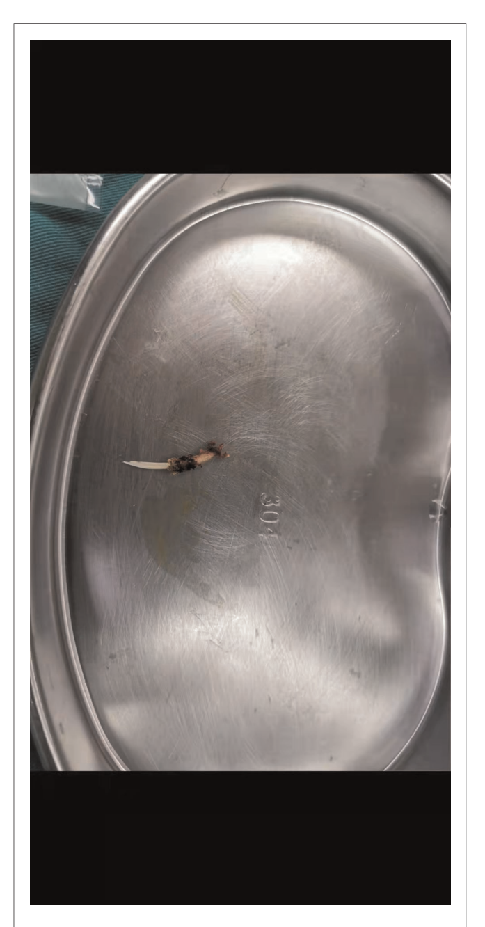
FIGURE 2 | Fish bone of length 2 cm and diameter 0.2 cm extracted from the liver.