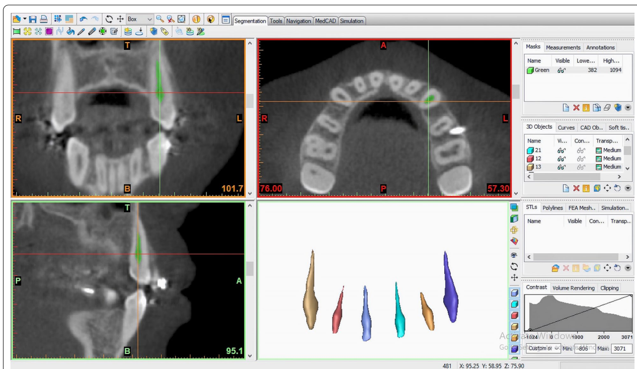
Fig. 1 Screenshot image for one of the included patients illustrating the segmented pulp tissue, from the CBCT scan, in all 3 planes of space and source of 3-Dimensional images of the pulp cavities for the maxillary anterior teeth (image rendered using Mimics imaging software)

Descriptive statistics (means and standard deviations) were calculated. The normality of the main dependent variables tested using the Shapiro-Wilks test ( P > 0.05 ) showed that they were almost normally distributed in both groups. Paired t-tests were used to compare mean changes (T0 vs T1) within groups and independent sample t-tests were used to compare mean differences (T0 – T1) between groups. Chi-square was used to test the distribution of males and females between and within groups. Pearson’s correlation coefficient was used to assess the relationship between the mean changes of each tooth pulp volume and its root length. Data were analyzed using the Statistical Package for Social