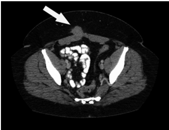
Figure 1. CT of the abdomen reveals a mass suggestive of a ventral hernia.

Extrapelvic endometriosis in general is very difficult to diagnose due to its rarity; the possibility does not readily come into the minds of the treating physicians. The most common differential diagnoses include stitch granuloma, cellulitis, and hernia. Umbilical endometriosis can pose a diagnostic quandary, because it can mimic a malignant melanoma or the “sister Mary Joseph nodule” associated with intraabdominal malignancies. Although sonography can also be used to facilitate the process of making the diagnosis in addition to CT and MRI, no pathognomonic radiological findings exist for an AWE. 16 Some literature suggests that there may be cyclical abdominal pain in