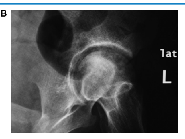
Figure 1. (A) Plain radiography (anteroposterior (AP) view of both hip joints) and (B) pelvic radiography (close oblique view of the left hip). Notes: Plain radiography of the hip joints: AP view and oblique view of the left hip showing heterogeneous matrix of the left femoral head giving geographical appearance with mixed sclerosis and lucent areas as well as relative mild narrowing of the ipsilateral joint space representing AVN-related changes.