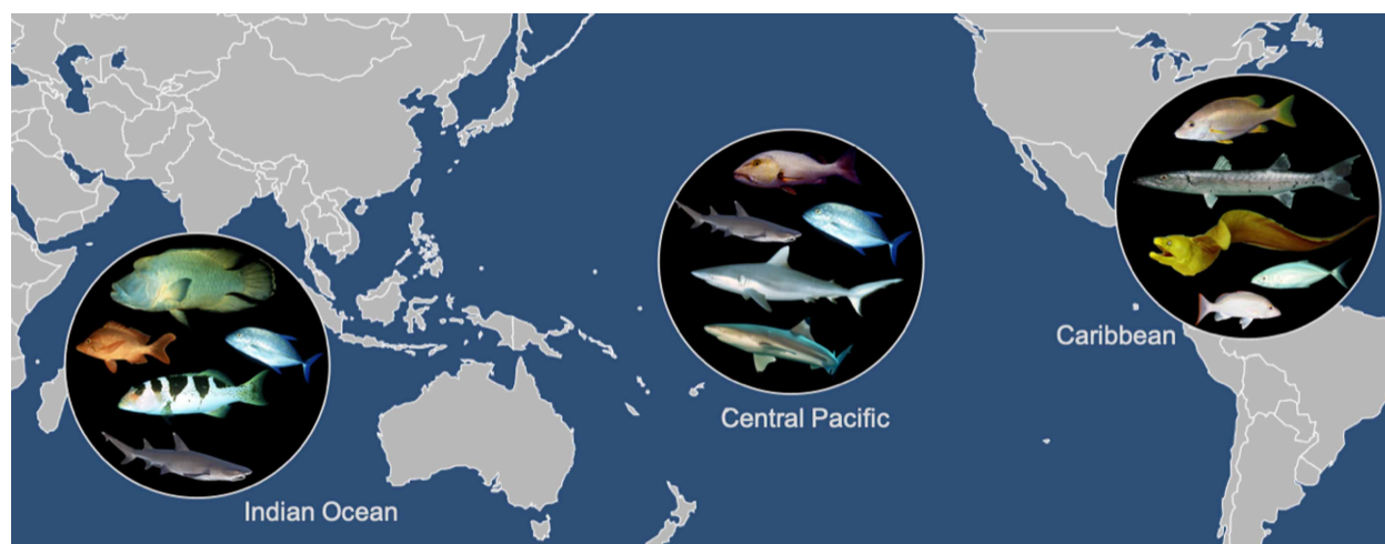
Figure 1. Images of the five top predators by biomass by three representative regions from underwater visual surveys (2005–2021). Data from the Caribbean were from Curaçao and Aruba. Data from Indian Ocean is from the Maldives and data from the Central Pacific is from the Line and Phoenix Islands. The images of Caranx melampygus , Carcharhinus amblyrhynchos , Caranx ruber , Lutjanus gibbus , Sphyraena barracuda , Cheilinus undulatus , and Plectropomus laevis were adapted from photos by Jack. E. Randall and are licensed under a Creative Commons Attribution-Noncommercial 3.0 Unported License, obtained from FishBase. The image of Lutjanus mahogoni was adapted from a photo by Roger Rittmaster and is licensed under Attribution-NonCommercial 4.0 International (CC BY-NC 4.0). The images of Lutjanus apodus and Triaenodon obesus were adapted with permissions from photographs by Carlos Estapeand Giuseppe Mazza, respectively. The remaining images were adapted from photographs by the author (BJZ).

observed in lower densities in protected areas [43]. In a comparison of fish assemblage structure across management zones of the GBR, a consistent signature existed with higher densities of multiple piscivorous fishes and lower densities of prey fishes within protected relative to less-protected areas [44]. Such evidence of prey