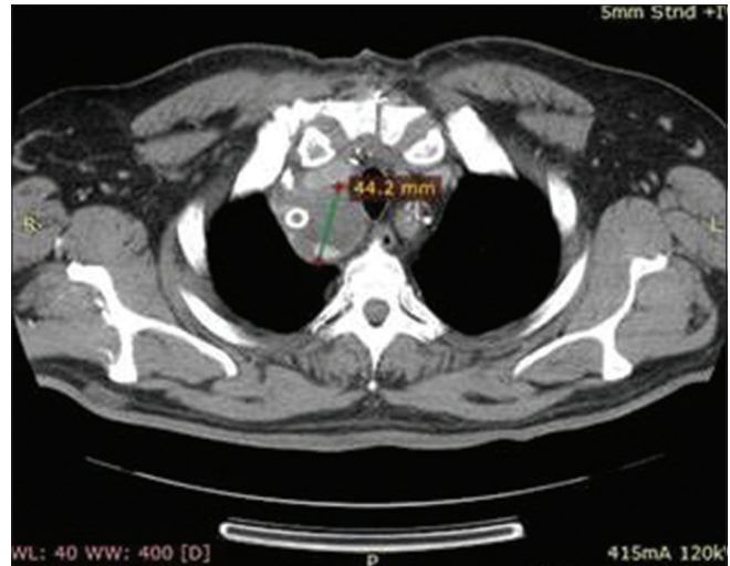
Figure 3: Computed tomography scan images demonstrating a new aneurysm of 4.4 cm max diameter beside the cover stent at the innominate artery

To avoid an aortic arch and descending aorta replacement with cardiopulmonary bypass, total circulatory arrest, and deep hypothermia, the patient was offered a less invasive hybrid endovascular procedure. Despite these complex diseases, the patient was treated successfully, and this fact determines the utility of the endovascular and the hybrid cardiovascular surgery. This approach represents a valuable alternative and may help reduce