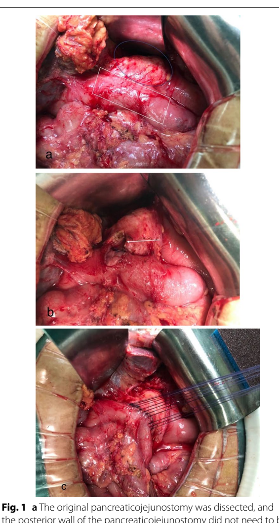
Fig. 1 a The original pancreaticojejunostomy was dissected, and the posterior wall of the pancreaticojejunostomy did not need to be dissected completely (the blue oval area is the remnant pancreas, the white quadrilateral area is the jejunal input loop). b A wedge resection was made to cut out the stricture tissue and expose the dilated remnant main pancreatic duct, then the anterior wall of the main pancreatic duct was cut about 2.0 cm along the longitudinal direction (white arrow). c Interrupted suturing with absorbable stitch between the pancreatic parenchyma and the full thickness of the jejunal wall

two-layer duct-to-mucosa technique was used in nine patients, while three patients had a one-layer PJ anastomosis. The method of anastomosis was not accurately recorded in two patients. At the time of the index operation, non-absorbable plastic pancreatic duct internal stents were placed in nine of the 14 cases. Even so, none of the stents could be found during the revision surgery. Histopathological analysis of tumor specimens from the index operation indicated benign (11/14, 78.6%), lowgrade malignant (2/14, 14.3%), and malignant tumors (1/14, 7.1%). Detailed information is shown in Table 1.