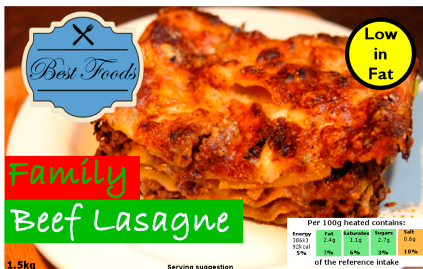
Figure 1. Example of food packaging with claims used in survey. Modified to include labels and text.

Three NHCs were used; the nutrition claim ‘Low in fat’, the health claim ‘With plant sterols. Proven to lower cholesterol’, and the satiety claim ‘Fuller for longer’. These claims were taken from products sold in the UK and Ireland. In addition, the absence of a NHC (no claim) was also investigated. ‘Low in fat’ was chosen due to the prevalence of claims relating to fat in the UK and Ireland [13,14]. ‘With plant sterols. Proven to lower cholesterol’ was chosen as claims relating to cholesterol and heart health were common [13,14], and it was believed that these claims would be more suitable for the foods chosen than other common health claims such as those relating to digestion. ‘Fuller for longer’ is not currently an official registered nutrition or health claim, however, this has been previously used on products within the UK and Ireland. Furthermore, previous research which investigated satiety claims (claim only with no product) suggested that future research should examine the impact of satiety claims in the context of product packaging [33].