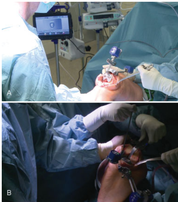
Fig. 4 After the resection, both (A) femoral and (B) tibial cutting surfaces can be checked and validated using the electronic pods, before placing the trial components, with the same sequence of multiple movements.

Outcomes were described as means \pm standard deviation (SD). Differences between the two groups according to baseline characteristics, preoperative and postoperative mechanical alignment, tibial slope, and clinical outcomes were explored using Wilcoxon's test. Statistical significance was set at p < 0.05 .