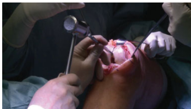
Fig. 1 In the navigated total knee arthroplasty, a bone spike is impacted into the distal femoral sulcus ~10 mm anterior to the posterior cruciate ligament, in the anatomic location of the distal femoral mechanical axis, to provide a reference for the cutting guide.

For the wireless navigation technique, the surgical workflow follows the classic method of femoral and tibia bone resection with each bone resected independently along the mechanical axis (►Fig. 1). Before the resection, the electronic pods, mounted on a tibial extramedullary guide (for the tibia) and on a femoral intramedullary guide (for the femur), are activated through several movements (abduction, adduc-