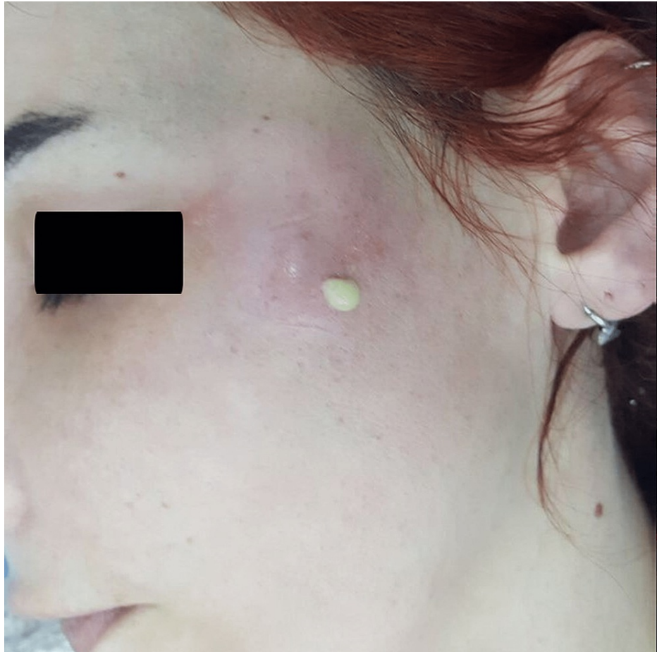
FIGURE 3: Drainage of the abscess and pus coming out.

With the detailed history, it was understood that she had PAAG filler injection over her bilateral cheek bone and temporal areas five years ago. During the follow-ups, there was no bacterial growth on the culture. After the treatment, the patient healed with some hyperpigmentation and deformity on the zygomatic area.