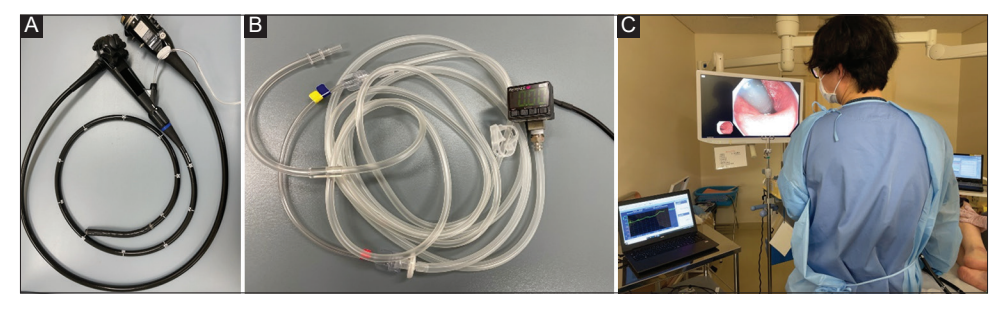
Figure 1 Setting of the endoscopic pressure study integrated system (EPSIS) in the lower rectum. (A,B) The tip of the disposable irrigation tube (AF-WT; Forte Grow Medical Corp., Tochigi, Japan) was directly connected to the working channel cap (A), and the other side of the tube was connected to the internal pressure measuring device (TR-W550, TR-TH08, AP-C35; Keyence, Osaka, Japan) (B). (C) At the end of the examination, we desufflated as much of the \rm CO_2 gas that entered through the oral side as possible. The colonoscope was then inverted in the lower rectum and fixed in a position that allowed observation of the anal region in retroflex position. Insufflated \rm CO_2 and intraluminal pressure were measured using EPSIS measuring instruments

A colonoscope was initially inserted using a transanal approach to perform the intended examination, including screening for colorectal cancer, diarrhea, and bloody stools. At the end of the examination, we desufflated as much of the \mathrm{CO}_2 gas (entering from the oral side) as possible. Subsequently, the colonoscope was inserted in the lower rectum and fixed in a position that allowed observation of the anal region in the