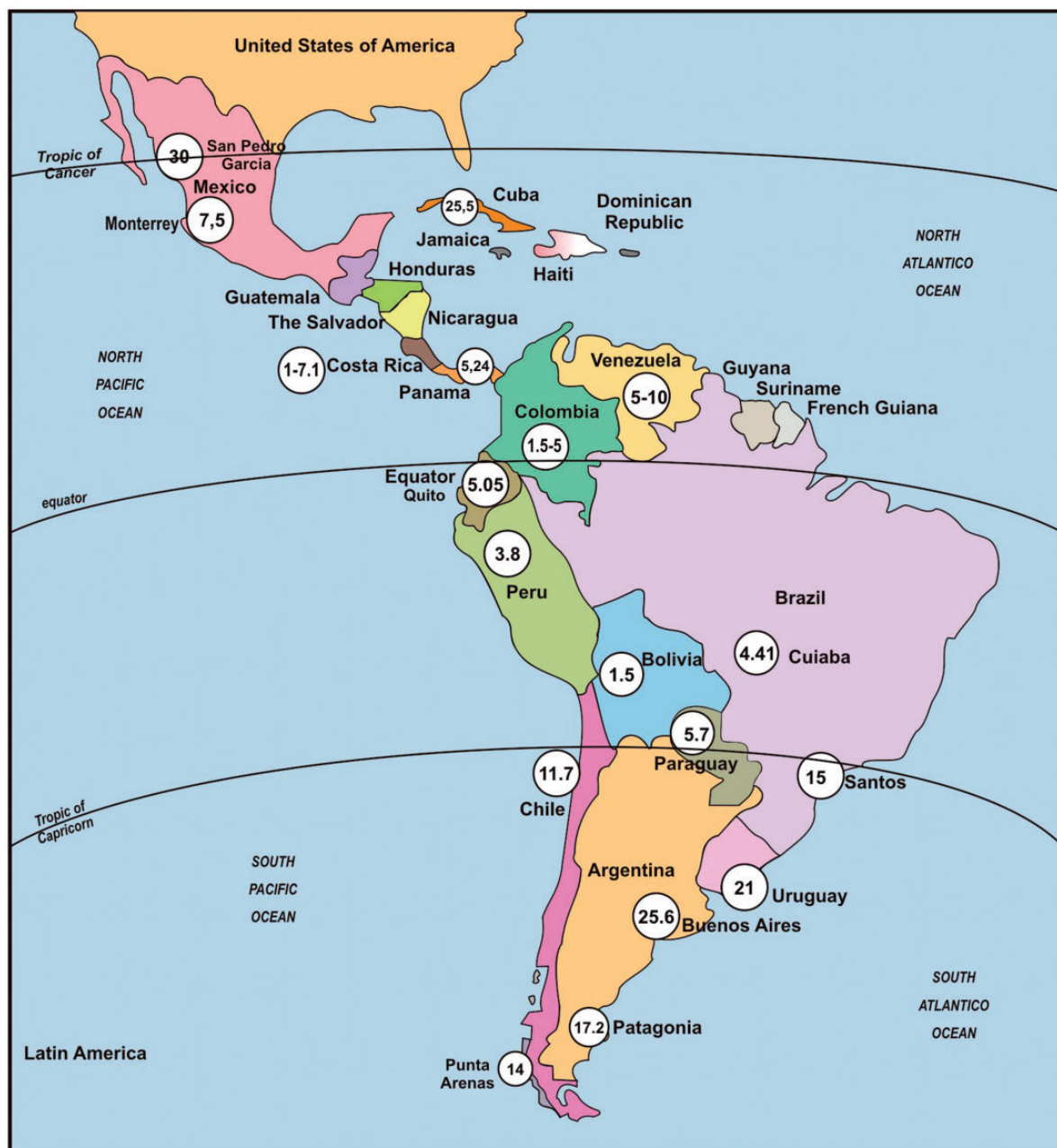
Figure 1. Prevalence of MS in Latin America and the Caribbean.