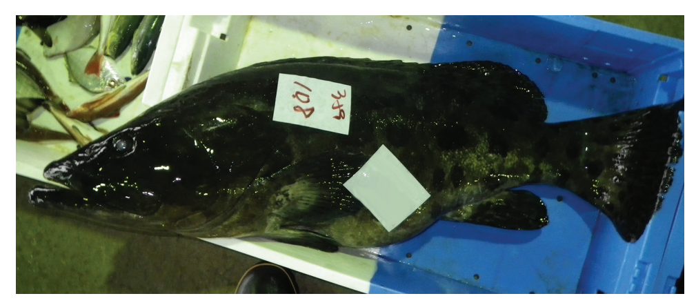
Figure 3. An adult individual of Epinephelus tukula (ca 100 cm TL, photo number KPM-NR 179394A) landed at Meitsu Fishing Port, Nichinan City, Miyazaki Prefecture, eastern coast of Kyushu, southern Japan. Photograph R. Miki, 17 May 2012.

the Kuroshio Current after maturing in their core distributional area (Motomura et al. 2007a; Ogihara et al. 2010; Itou et al. 2011; Senou et al. 2013). However, E. tukula is a large, territorial, epibenthic species (Craig et al. 2011), and may not migrate between regions (i.e. from tropical to temperate) after maturation. Motomura et al. (2007b) also documented a similar case in a congener, Epinephelus amblycephalus . Therefore, the adult individual reported from Nichinan City in the present study may have matured after settlement or hatched in the region. In conclusion, Japanese populations of E. tukula possibly reproduces in both the Ryukyu Islands and the warm temperate region of Japan that is affected by Kuroshio Current. On account of the facts that E. tukula has high commercial value and is vulnerable to fishing pressure, and that the species possibly reproduces in Japan, its Japanese Red List for marine organisms ranking as CR has been effective in terms of giving attention to the status of the species' northernmost population, including both the tropical Ryukyu Islands and the temperate region further north. Further delineation of the E. tukula populations in Japan can be determined by future studies on size frequency distributions and reproductive biology.