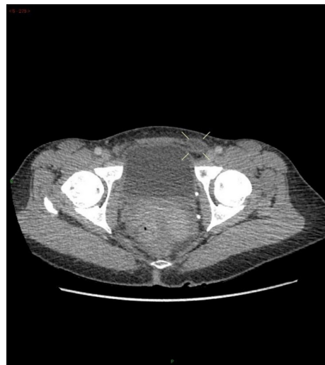
Figure 2 Contrast enhanced axial CT scan demonstrating a non-enhancing fluid collection, located medially to the femoral vessels in the left inguinal canal.

Full personal protective equipment was donned and minimal personnel were present in theatre in accordance with joint National and Health Protection Society guidelines. 12 13