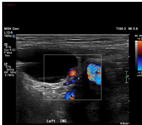
Figure 1 Transverse Doppler ultrasound scan demonstrating an anechoic, defined tubular cystic structure with a thin septation in the left inguinal region.

embedded benefit of conferring her protection as a COVID-19-vulnerable patient.