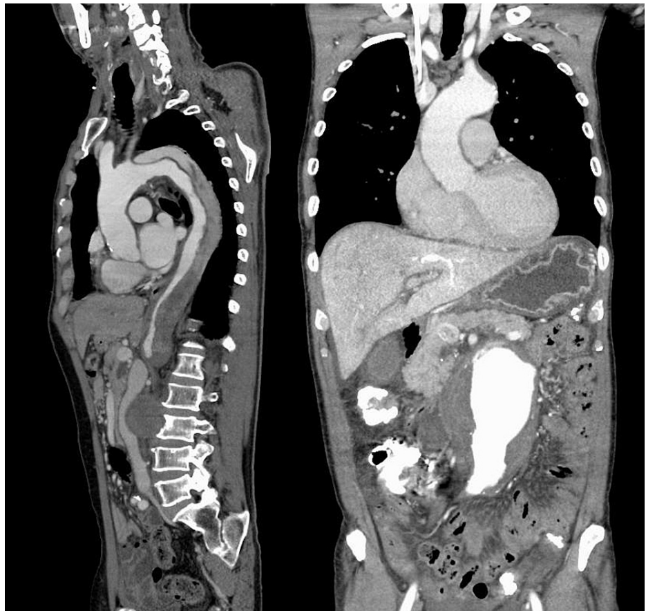
FIGURE 1: Chest and abdominal CT.

Chest and abdominal contrast-enhanced CT show a Stanford type B aortic dissection and abdominal aortic aneurysm.