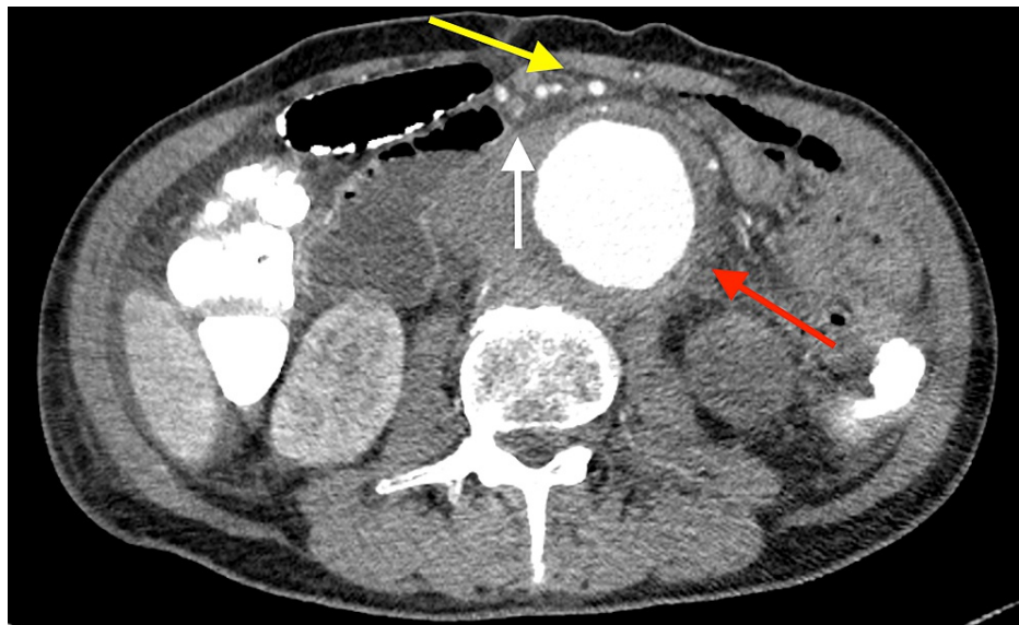
FIGURE 4: Abdominal CT.

The duodenum (white arrow) is compressed between the superior mesenteric artery (yellow arrow) and abdominal aortic aneurysm (red arrow).