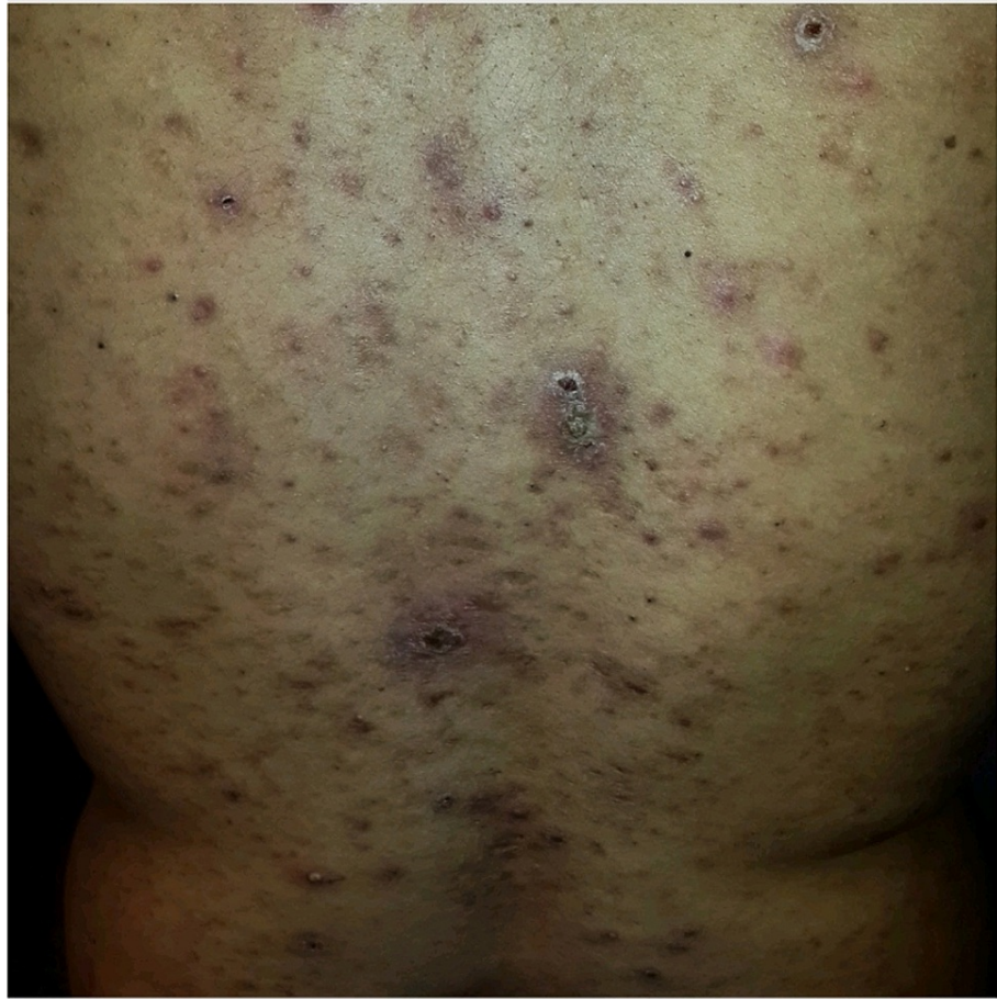
FIGURE 1: folliculitis of the back

The patient was initially managed with several courses of topical steroids to reduce the inflammation of the back. However, because of the lack of significant improvement, he was referred to our hospital for further investigation. Back lesions were noted to be sterile, resembled folliculitis, and had an acne-like appearance (Figure 1).