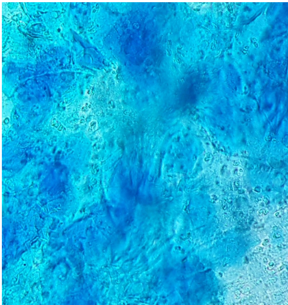
FIGURE 2: Microscopic examination of skin scraping, revealing fungal elements

Results of Sabouraud's medium culture were compatible with Trichophyton rubrum (Figure 3).