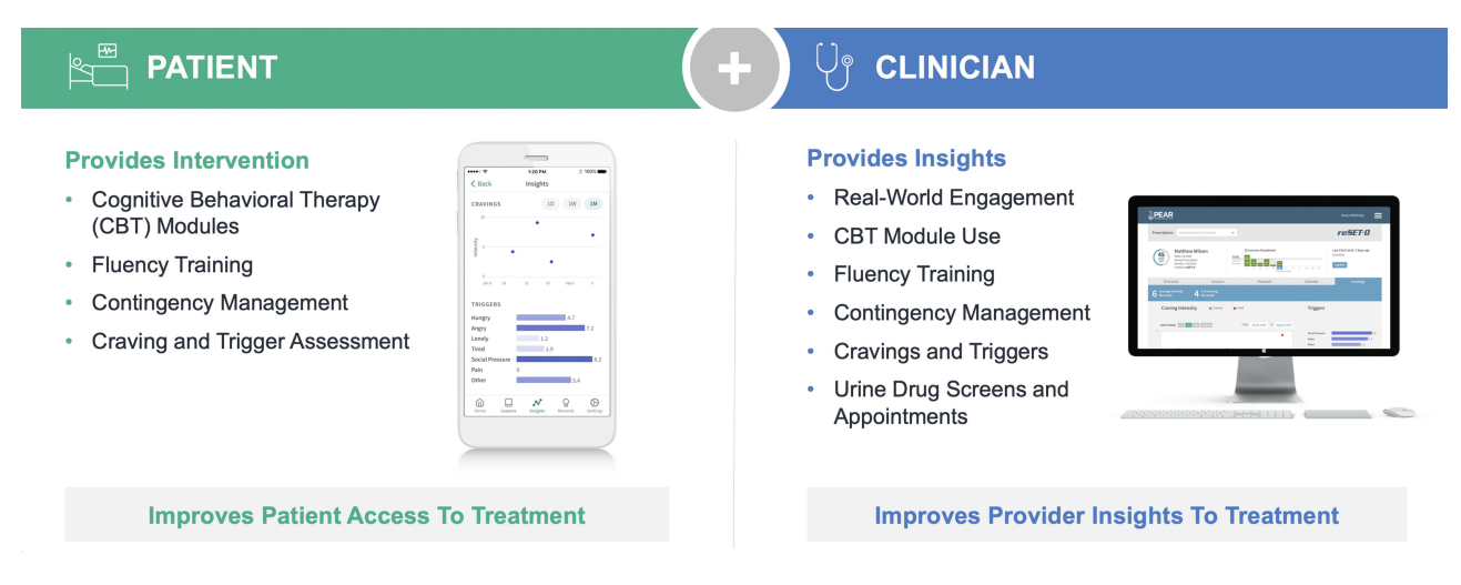
Figure I Example of patient and clinician interfaces for reSET-O PDT.