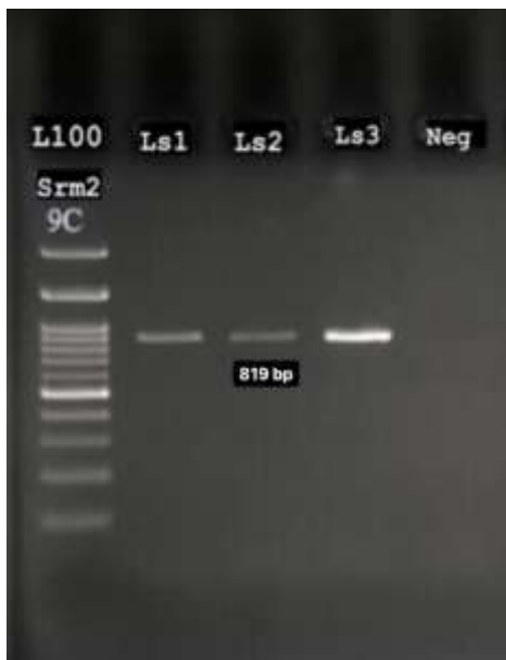
Figure 2. HBV pres/s amplification products electrophoresed on a 1.5% agarose gel L: Ladder 100-1000 bp, Ls: Left area of the pre s/s region, N: Negative control.

This study aimed to set up an appropriate technique and implement it on clinical samples of patients with chronic hepatitis B. For this purpose, ten patients were evaluated by designed specific primers, and the proper temperature and time protocol for amplification of the desired products containing the preS/S region was set up. Proper product bands of each target were obtained, and these products could be utilized to determine the sequence variations of different isolates, including deletion and substitution (Figures 2 and 3).