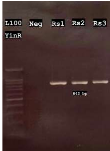
Figure 3. HBV pres/s amplification products electrophoresed on a 1.5% agarose gel L: Ladder 100-1000 bp, Rs: Right area of the pre s/s region, N: Negative control.