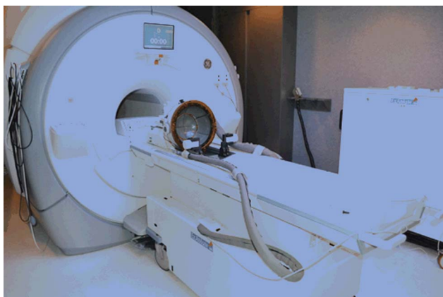
Figure 2 Commercially available magnetic resonance-guided (MR-guided) focused ultrasound. 10

A further multicentre prospective trial in the USA randomised patients to SRS with high (24 Gy) or low (20 Gy) dose delivered to the targets. 25 At 3 years, seizure freedom was 77% in the high dose and 59% in the low dose group. Again, the neuropsychological profiles compared favourably with results from conventional surgery.