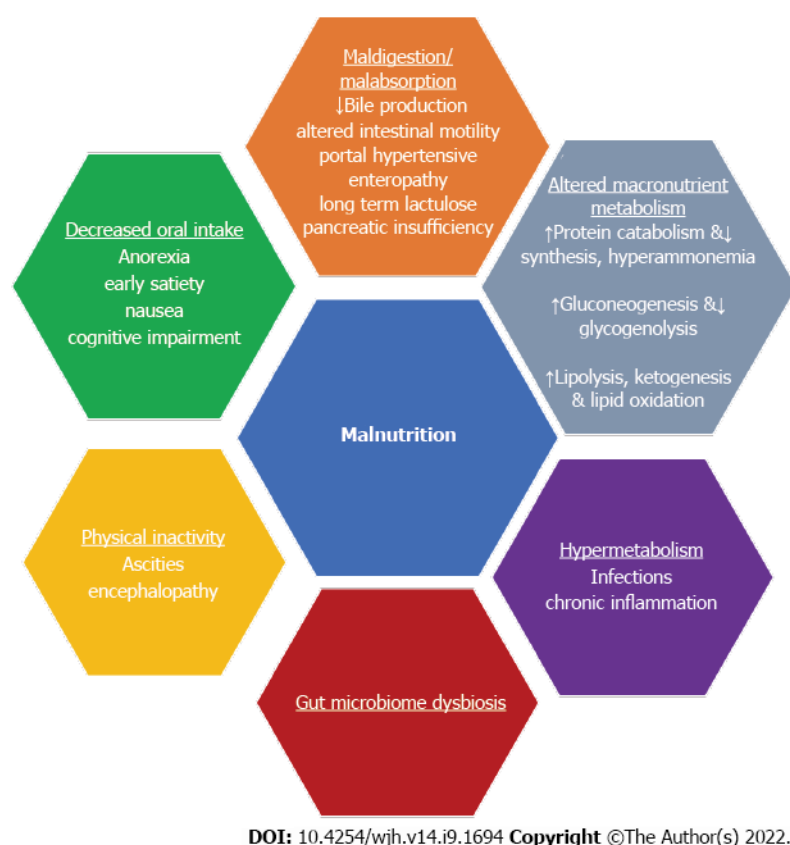
Figure 1 Factors contributing to malnutrition and sarcopenia in liver cirrhosis.

sarcopenia by upregulating myostatin which inhibits protein synthesis[12]. Testosterone levels are decreased in cirrhotic males and this further contributes to decreased protein synthesis and loss of muscle mass[13].