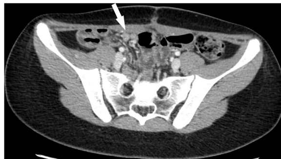
Fig. 2. Pre-operative CT-SCAN: peritoneal metastasis were found in the contest of the right rectus muscle and of the mesentery next to the umbilicus”.

In January 2018 the patient underwent CRS and HIPEC. General anaesthesia was induced with Propofol using the TIVA-TCI Schnider model [effect-site targeting]; also, Methylprednisolone 3 mg/kg was given as part of an internal protocol aimed at reducing cytokine release during major abdominal surgery. Right radial artery was cannulated for invasive blood pressure monitoring, and a central line catheter was inserted into the left internal jugular vein using an US-guided posterior approach. An epidural catheter was placed in lateral decubitus with the median approach, at D12-L1