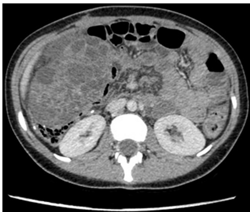
Fig. 1. Follow up CT-SCAN of the abdomen that highlight the presence of two bulky pelvic mass both growing from ovaries.