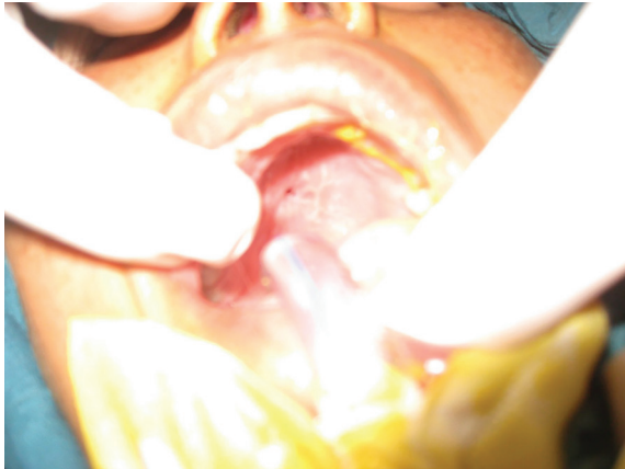
Fig. 1: Post-septoplasty palatal fistula in an otherwise normal palate of a 31 y/o female patient.

examination, a small perforation in the hard palate was observed (Figure 1). There was not any undiagnosed underlying submucous cleft palate or high palatine vault (Figure 2). She was subjected to surgery under general anesthesia. Palatal perforation was repaired with mucosal hinge flap as nasal lining and a mucoperiosteal rotational flap for oral coverage. In the subsequent follow-up, no recurrence of fistula was observed and the problems of regurgitation and hypernasal speech were solved.