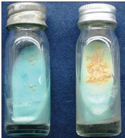
Figure 2: Mycobacterium tuberculosis : Growth on Lowenstein - Jensen medium