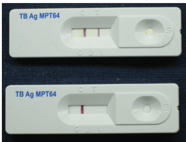
Figure 3: Immunochromatography test for detection of MPT64 antigen

are the points to prove that the modified slide culture is a better method compared to other conventional methods: