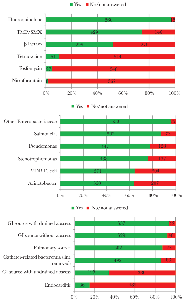
Figure 1. Patient vignette of a 36-year-old woman who presented with symptoms of acute pyelonephritis, who responded to initial intravenous antibiotics, and had Escherichia coli recovered in both blood and urine cultures, susceptible to all listed agents; N = 575. (A) Which of the listed oral agents would respondents feel comfortable transitioning to. (B) Would respondents be willing to use an oral antibiotic if the organism was not an E. coli , but rather ____? (C) Would respondents feel comfortable using an oral agent given the following sources of the Gram-negative bacteremia? MDR, multidrug-resistant; TMP/SMX, trimethoprim/sulfamethoxazole.

Gram-positive bacteremia exists. Agreement on transition to oral therapy in Gram-positive bacteremia appears most consistent in pneumonia (with bacteremia) caused by S pneumoniae . Based on small retrospective studies and a single randomized controlled trial, clinical practice guidelines for community-acquired pneumonia currently suggest that a “patient should be switched from intravenous to oral therapy when they are hemodynamically stable and improving clinically” [12–14]. In a recent study, a randomized clinical trial supporting transition to oral antibiotics in endocarditis was published. This study of