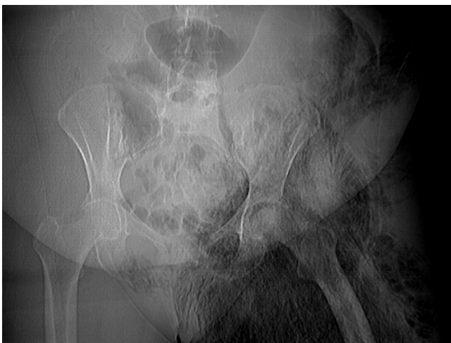
Figure 1 Plain XR showing extensive and ominous gaseous formation in the left pelvis and thigh.

Intravenous antibiotics including Penicillin, Gentamicin and Metronidazole were urgently administered together with crystalloid rehydration. Surgery was seriously considered but withheld due to the extensive nature of the infection. Not unexpectedly, the patient died of overwhelming sepsis in 12 hours despite rigorous and intensive medical therapy. Hyperbaric therapy was not available. Blood culture subsequently returned positive for Clostridium Septi-