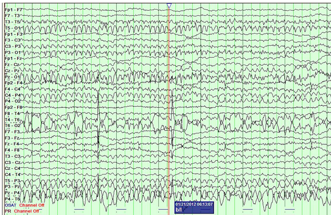
Fig. 2. EEG, hospital day 5. Rhythmic sharp theta discharges starting in the left occipital leads and evolving in amplitude, frequency and morphology, spreading to neighboring electrodes and to right occipital leads as well.