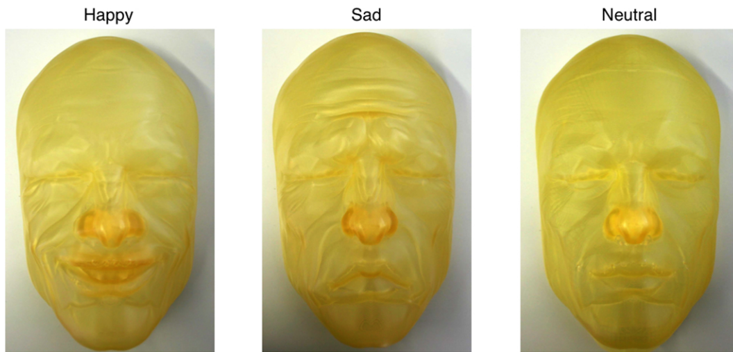
Figure 1. Facemasks depicting happy, sad, and neutral faces, respectively.

without adaptation. The test facemask was randomly chosen from three facemasks (happy, sad, and neutral). Each participant explored each test facemask once with a 1 min break between trials. The percentage of sad responses from participants was calculated for each test facemask. In the adaptation experiment, an adaptation facemask was positioned on the left side of a table in front of the participant, and a test facemask was placed on the right. During adaptation, participants haptically explored the adaptation facemask with their eyes closed for 20 s, after which they haptically explored the test facemask for 5 s. Participants were then requested to classify the test facemask as either happy or sad. The adaptation experiment was performed under two adaptation conditions: (1) with adaptation to a happy facemask and (2) with adaptation to a sad facemask. In both cases, the expression of the test facemask was neutral. Each participant explored the test facemask once for each adaptation condition with a 1-min break between tests. The percentage of sad responses from participants was calculated for each adaptation condition.