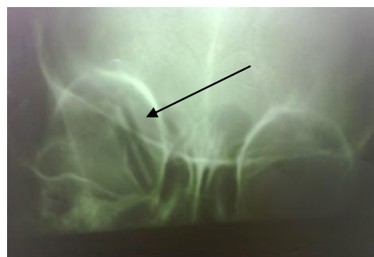
Figure 2: X-ray of the existence of an object with low density in retro-orbital space