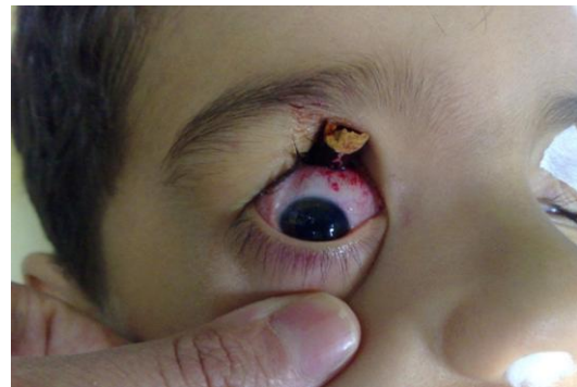
Figure 1: The penetration of foreign object into the upper cavity of right orbit

One of the reasons this case is of special interest is because the penetrating object consisted of organic matter. The penetration of such objects into the orbit is rare compared to that of metal and non-metal objects. These types of objects are poorly tolerated, elicit an intense inflammatory reaction, and need to be removed urgently. During the removal of objects, and especially organic