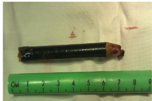
Figure 3: The removed pencil from orbit space