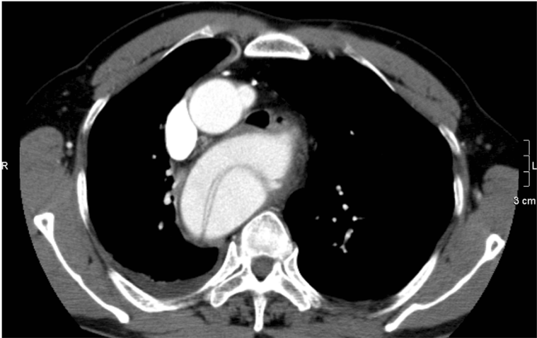
Figure 1 CTA demonstrated a right-sided aortic arch and a right descending thoracic aorta, a type B aortic.