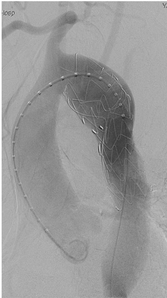
Figure 3 Postoperative angiogram after graft-stent implantation showed no evidence of endoleak, the false lumen of aortic dissection disappeared.