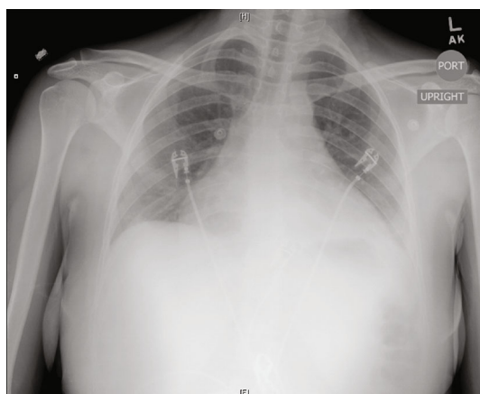
FIGURE 2: Enlarged cardio-mediastinal silhouette.

bacterial and viral cultures, and ANA, which only revealed elevated Cocksackie titers. For her recurrent disease with high-risk features, defined by tamponade and myocardial involvement, she was initiated on a combination of ibuprofen, a short prednisone taper, and 6 months of colchicine therapy.