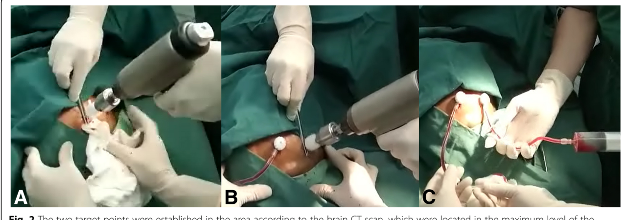
Fig. 2 The two target points were established in the area according to the brain CT scan, which were located in the maximum level of the hematoma, and chosen to prevent injury to superficial temporal artery and its branches and middle meningeal artery ( a - b ). After the inner needle was retrieved, bloody fluid, which was not coagulable, could be extracted from the subdural regions respectively ( c )

with the instillation of urokinase. Favorable outcomes were shown in all cases (mRS scores 0–2) at 6 months after surgery. Table 2 demonstrates that TDC for TASDH is safe, controllable, and effective.