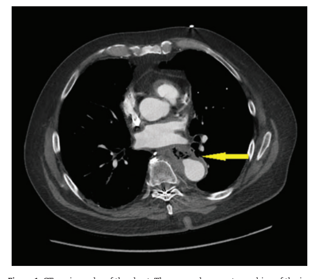
Figure 1. CT angiography of the chest. The arrow shows out-pouching of the intravenous contrast within the descending thoracic aorta, with marked mural thickening of the adjacent esophagus, with extra luminal foci of air between the esophagus and the aorta.

episodes of massive hematemesis. The patient was intubated for airway protection and resuscitated with intravenous fluid, packed red blood cell transfusions and platelet transfusions.