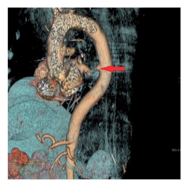
Figure 3. 3D reconstruction image. The red arrow shows out-pouching of the descending thoracic aorta.

therapy alone or concurrent chemoradiation therapy (CCRT) [6]. Sivaraman et al. described a case similar to ours, in which a patient receiving radiation therapy for lung cancer developed an AEF with no evidence of residual tumor on autopsy, proving a definitive role of radiation therapy in the development of AEF [4]. Gabrail et al. reported a patient with esophageal cancer, who developed AEF after pre-operative CCRT, where chemotherapy was thought to act as a radio sensitizer, which potentiated the effect of radiation on the aortic wall [7]. Um et al. described a patient who developed AEF after receiving chemo-irradiation for non-small cell lung cancer and subsequent esophageal stent placement [6].