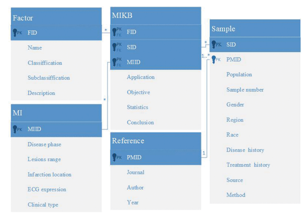
Figure 3. Entity relationship diagram of MIRKB.