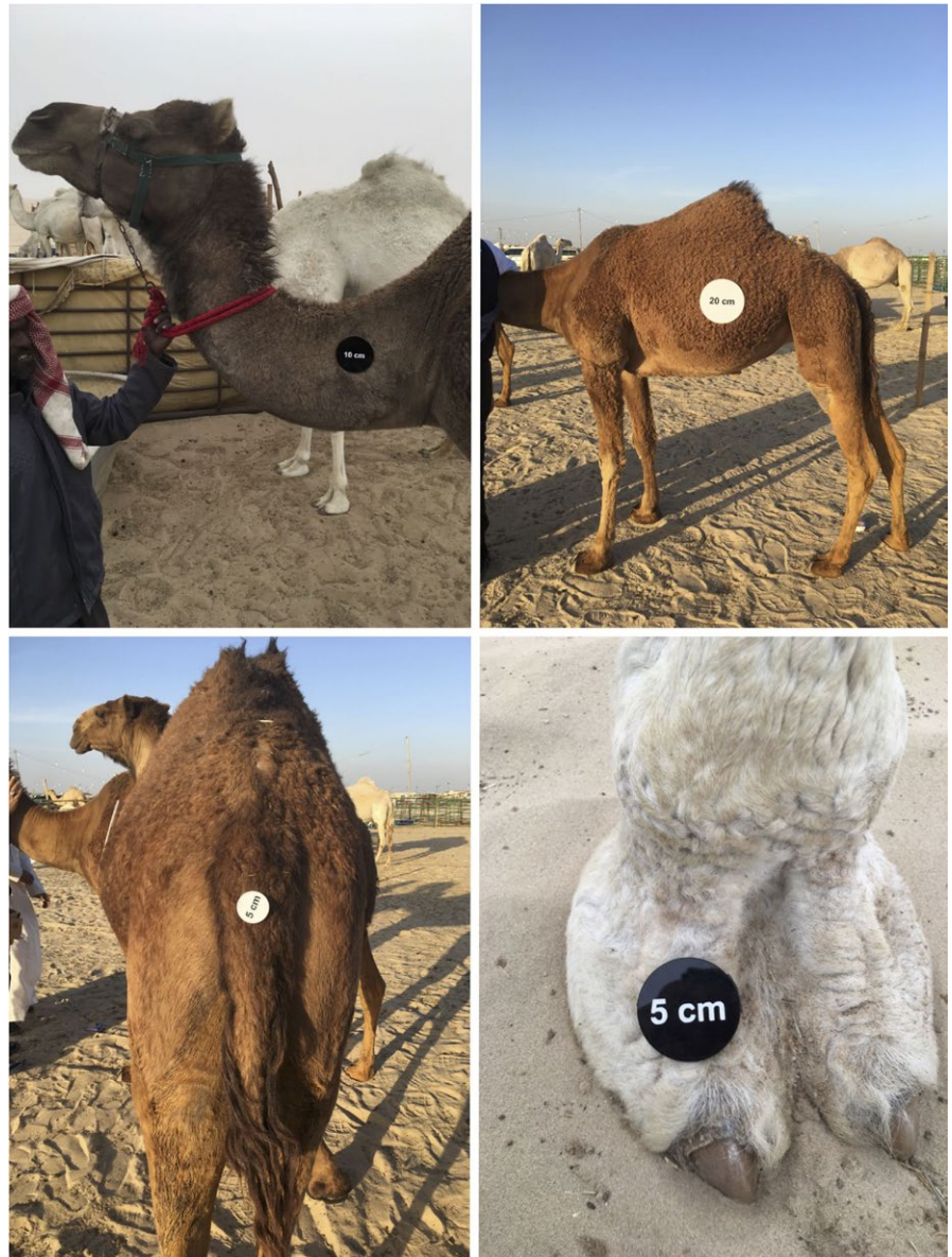
FIGURE 4 Images of camel neck, body, tail, and foot captured with SamplEase . Scale disks (5, 10, 20 cm) are placed on the body parts to allow for extraction of scale factors