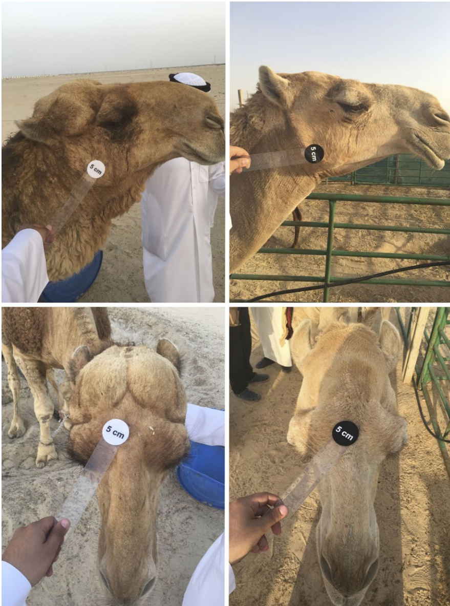
FIGURE 5 Lateral and dorsal views of camel heads. A 5 cm scale was placed on each image for morphometric analyses

Photographing individuals from which samples are taken ensures that phenotype can be linked with genotype. More specifically, it allows the researcher to spend less time collecting phenotypic data in the field, and more time collecting biological samples, as the phenotypic characterization of the sampled individuals can be done off-site (i.e., from the images).