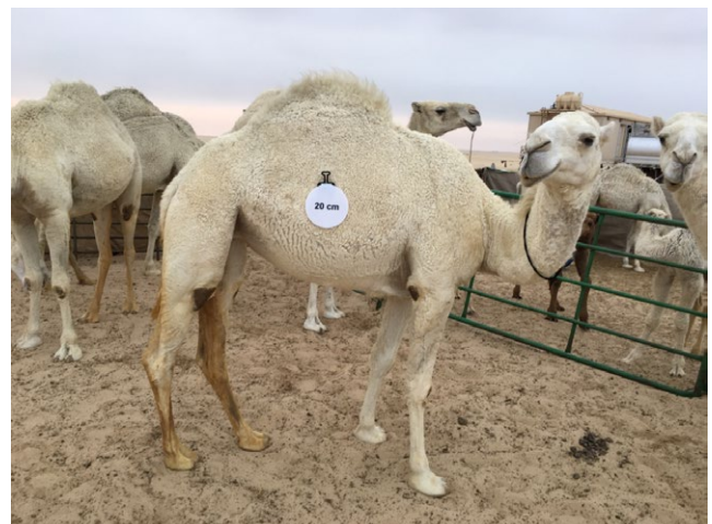
FIGURE 3 Example of a photograph taken using SamplEase of a white camel

number is later concatenated with session information to generate a unique sample identification number, which is included in the output table.