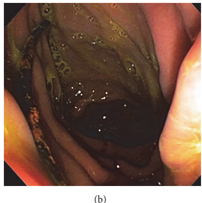
FIGURE 3: (a) ERC showing black pediatric feeding tube with overlying biofilm protruding from the papilla. (b) ERC with successful extraction of black pediatric feeding tube from the papilla.