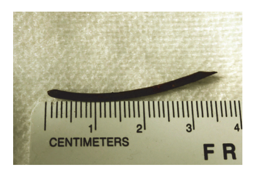
FIGURE 4: Extracted pediatric feeding tube.

and thereby decrease the risk of ABS formation [9]. However, T-tubes have been associated, at least in some studies, with higher rates of biliary complications, especially leakage from the T- tube exit site, and over the last couple decades are thus no longer routinely used in LT at most centers [2, 10]. In cases where there is significant size mismatch between the donor and recipient bile ducts, additional measures which have been employed include: partially closing a patulous recipient CHD or CBD, spatulating the donor duct, everting the recipient CBD, creating a common orifice between the cystic and common ducts, side-to-side ductal anastomosis, or choledochoduodenostomy. These techniques may be performed with or without the use of temporary internal stents.