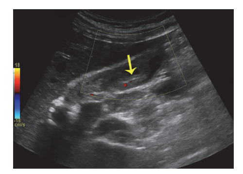
FIGURE 1: Abdominal ultrasound with filling defect in bile duct.

a ductoplasty was performed with part of the recipient bile duct being oversewn and an end-to-end choledochocholedochostomy being created with running circumferential 5-0 absorbable sutures. The total cold ischemia time was 8 hours, 32 minutes, and the total warm ischemia time was 41 minutes. There were no intraoperative complications, and the patient recovered well following surgery. He was managed on tacrolimus and did well for a decade. Approximately halfway through this period, for geographical and insurance reasons, the patient transferred LT care to our institution. At his 10 year post-LT appointment, the patient endorsed newonset generalized pruritus and was noted to have developed multiple albeit relatively minor abnormalities in his serum liver test profile, with an alkaline phosphatase of 121 (normal: 35-115 U/L), aspartate aminotransferase of 53 U/L, alanine aminotransferase of 68 U/L, and total bilirubin of 1.2 mg/dL.