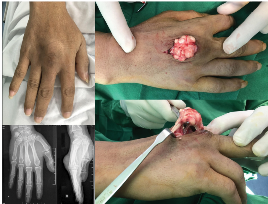
Figure 2 Clinical picture of mass at the dorsal aspect of right hand with soft tissue mass with no apparent findings at the radiograph. Note: Intraoperative finding revealed a white chalky mass adhering and infiltrating the tendon.

Serum uric acid concentration represents the balance between the breakdown of purine and excretion of uric acid. The solubility threshold is approximately 7 mg/dL, and the likelihood of crystal tissue deposition will increase if interstitial fluid is oversaturated. 4,5 Despite this, many people with hyperuricemia do not develop gout or even form uric acid crystals. 6