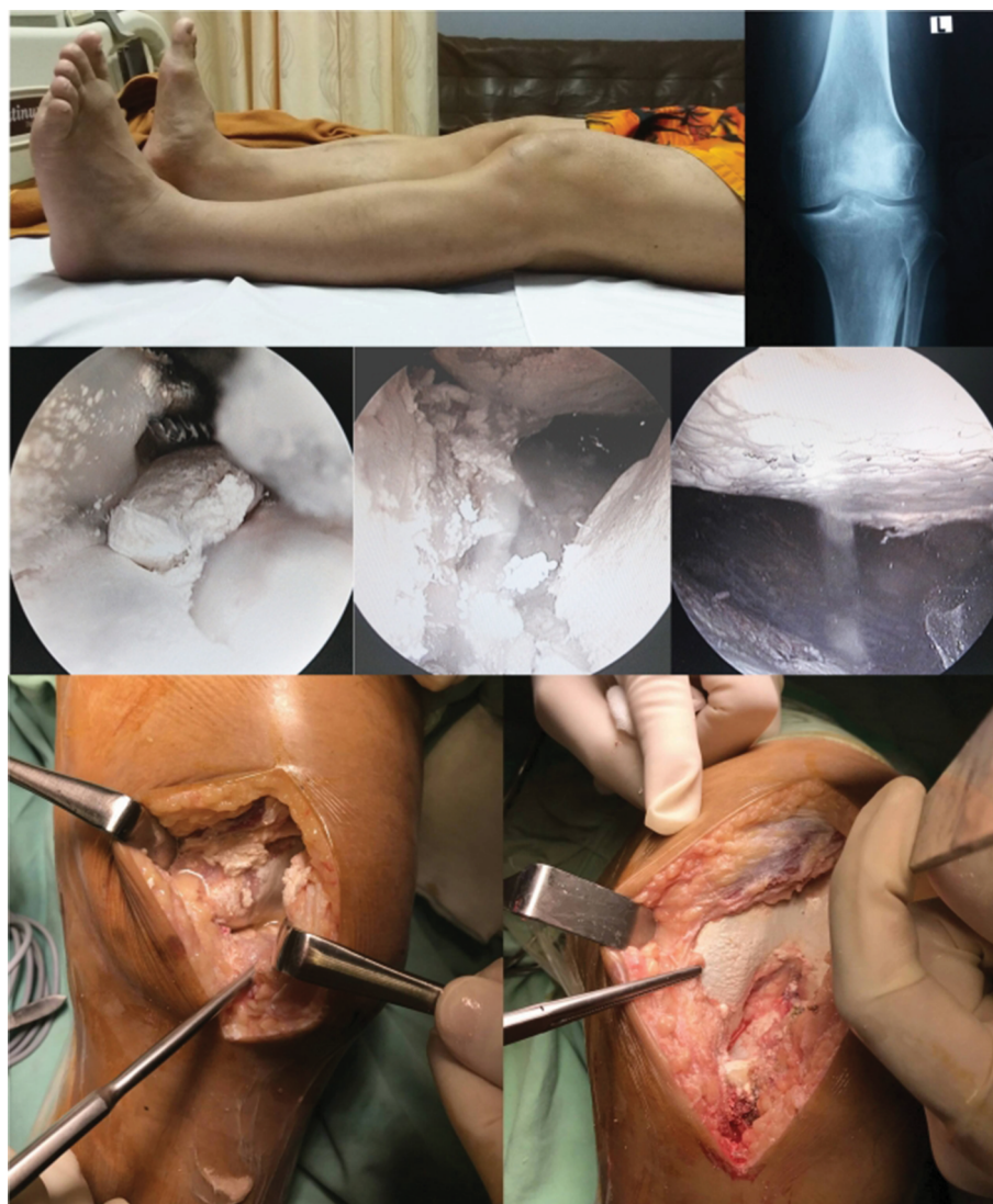
Figure 3 Clinical picture of knee in fixed 10 degree flexion and normal radiography.

Notes: Intra-arthroscopic findings revealed a white chalky lesion with tophaceous loose bodies. Open debridement revealed extensive involvement of all joint surface.