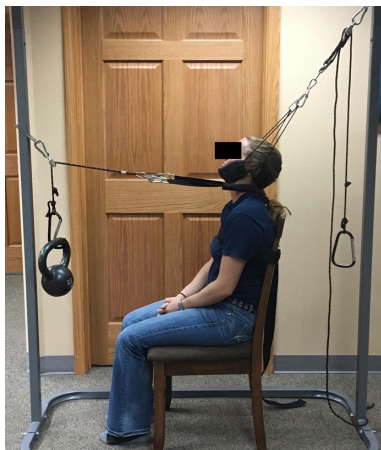
Fig. 2. Pope 2-way cervical extension traction.