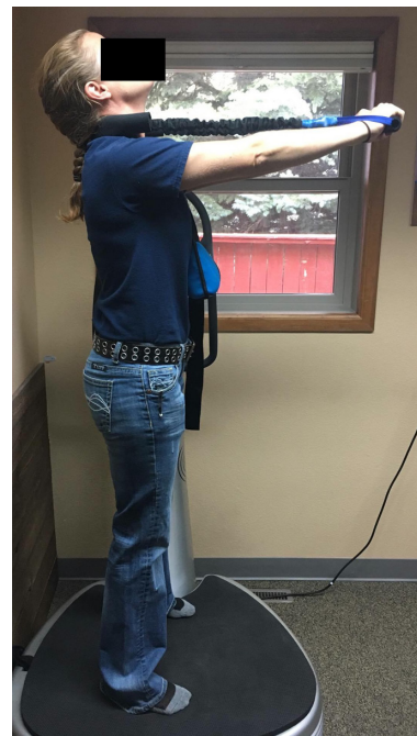
Fig. 3. Cervical mirror image extension exercises.