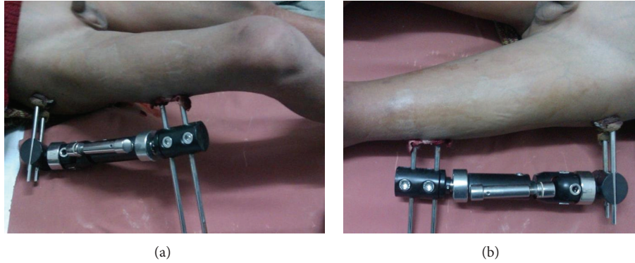
FIGURE 2: Clinical photographs of monolateral external fixator in place (a) with range of flexion movement at hip with fixator on (b).